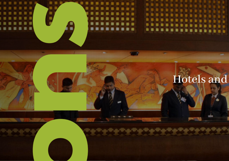
Hotels and restaurants