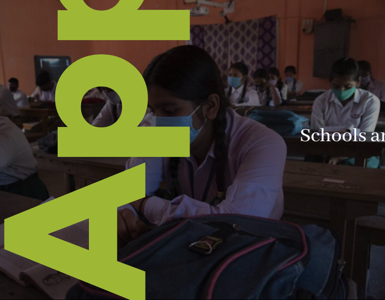
Schools and colleges