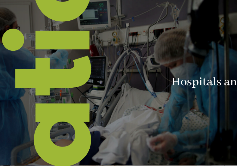
Hospitals and healthcare