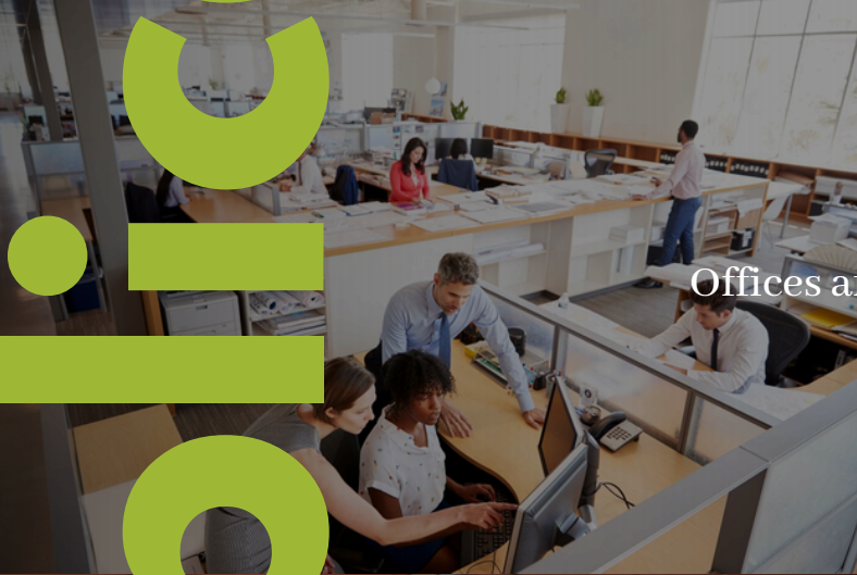
Offices and banks