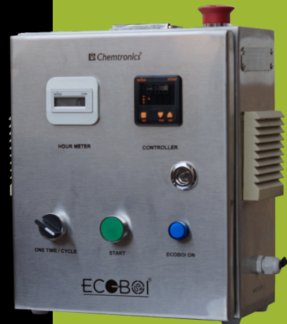
PORTO & MDT Series